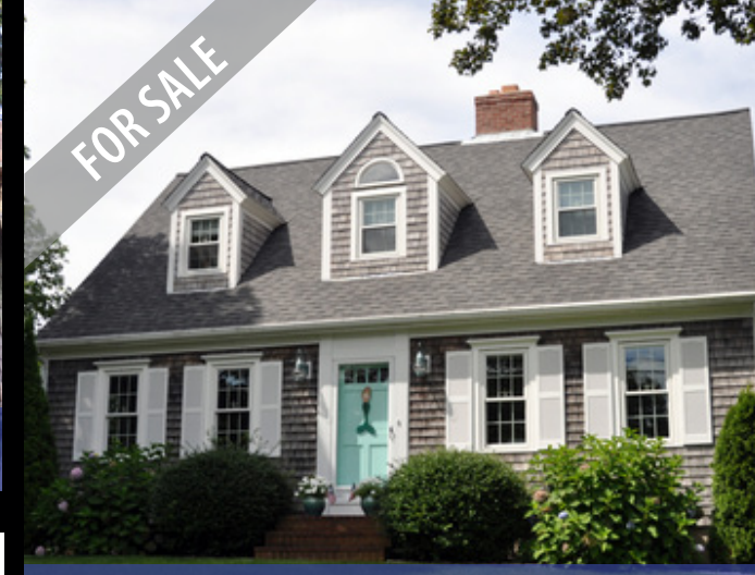
Beachside Feel – $1,099,900